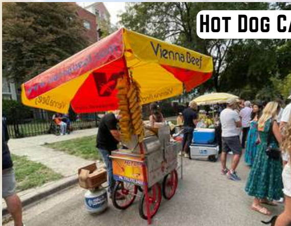
HOT DOG CART